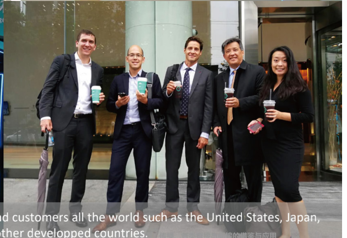
The stars at the exhibition are welcomed by enterprises and customers all the world such as the United States, Japan, Europe, South Korea and other developed countries.